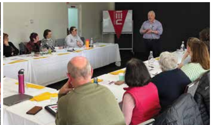
Reps training day in Wagga Wagga in August.

After a revamp in 2023, the IEU reps training program has been warmly received by reps across NSW and the ACT.