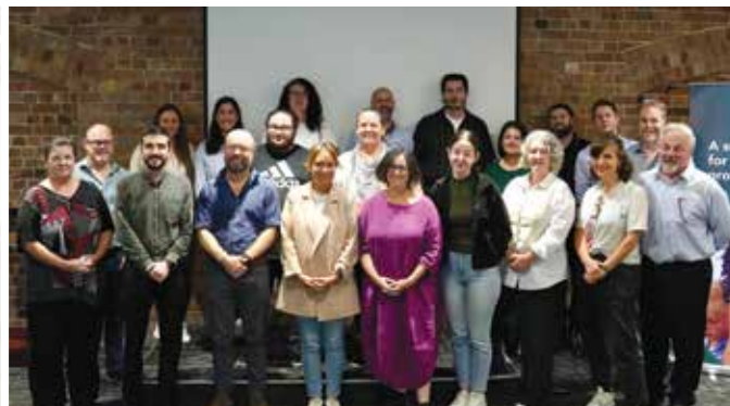
Reps training day at Sydney in April.