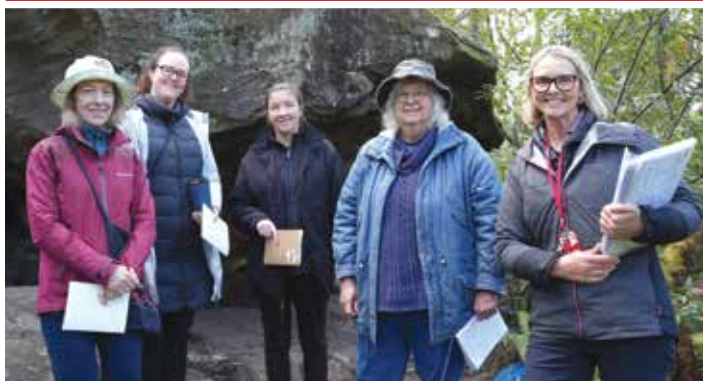
Primary school teachers workshop.