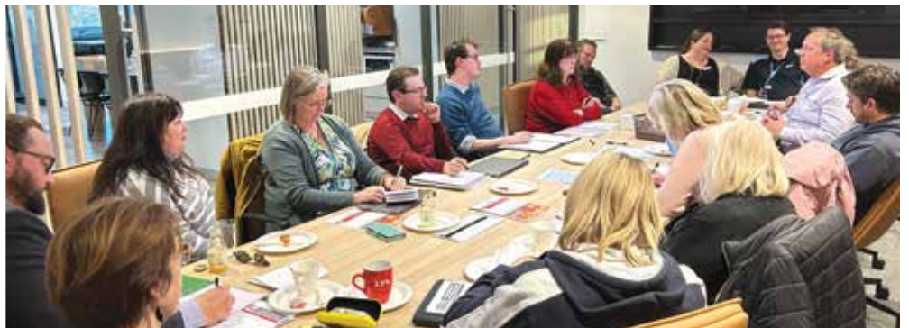
Members at the Monaro Sub Branch meeting, IEU Canberra office in August.