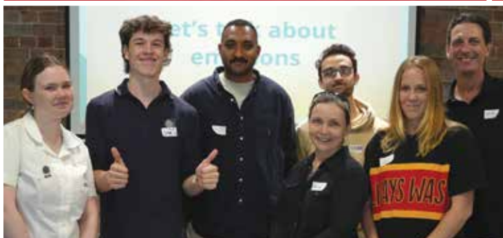
International Grammar School's Climate Fresk students, left, with IEU staff on 9 April.