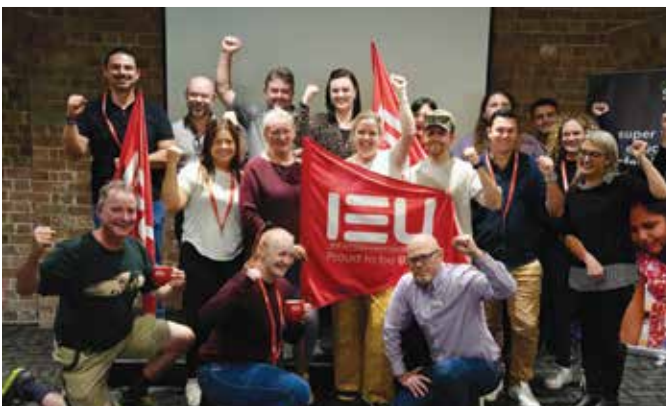
Reps training day in Sydney in May.