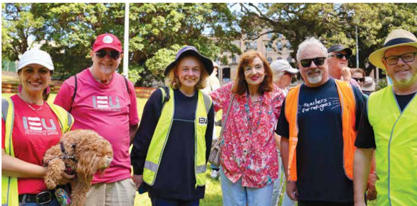
IEU members and friends at the Palm Sunday rally on 24 March.

Social justice involvement is an important part of the union's work, a commitment valued by many members. Much of the work undertaken supports, and is informed by, work being done by the Environment Committee, Women and Equity Committee and the Aboriginal and Torres Strait Islander Advisory Committee.