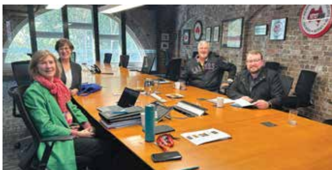
Principals' Sub Branch meeting in August.

The Principals' Sub Branch has had an active and impactful year, marked by several key meetings and initiatives. These activities are critical in ensuring that the voices of principals across various sectors are heard, and their concerns addressed.