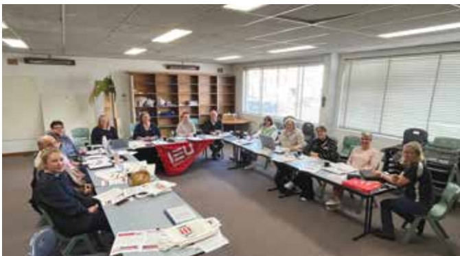
Reps training day at Orange in August.