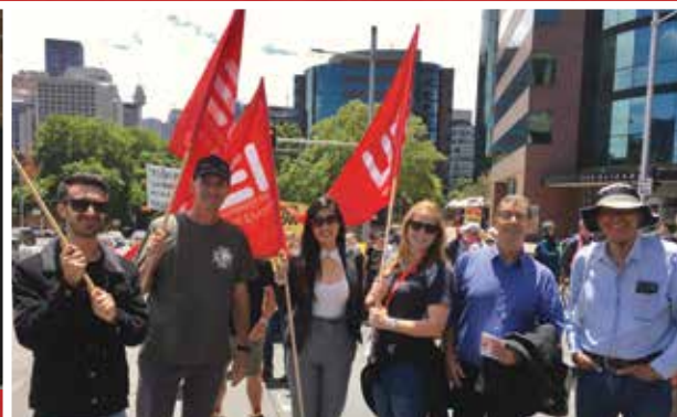
School Strike for Climate on 17 November 2023.