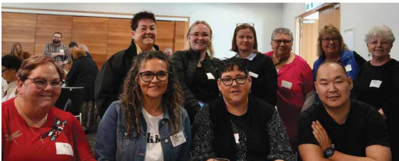
Support staff members and industrial officers at the IEU's Council meeting on 17 August.