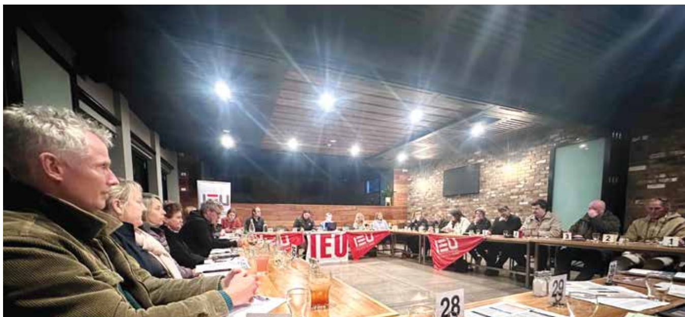
Hunter Valley sub branch meeting in July.

Like in all schools, workload is an issue for teachers