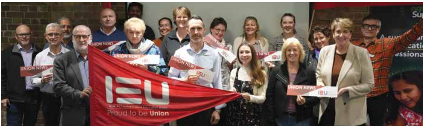
AIS reps training day at Sydney in May.