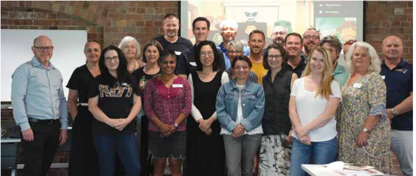
Reps training day in Sydney in November 2023.