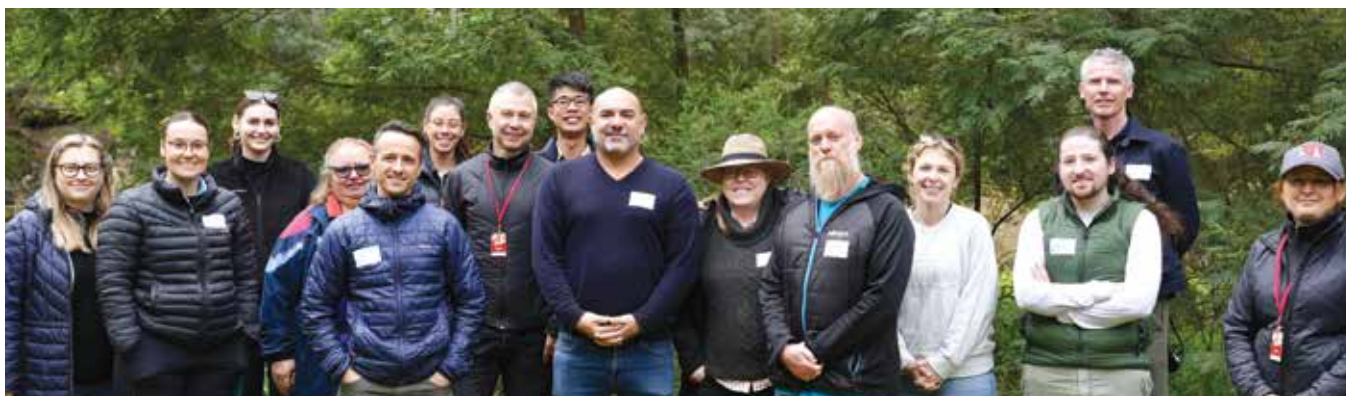
Secondary school teachers at the IEU's Environment Conference on 9 August.