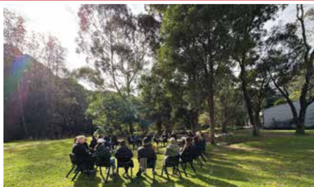
Members connect at the Environment Conference.