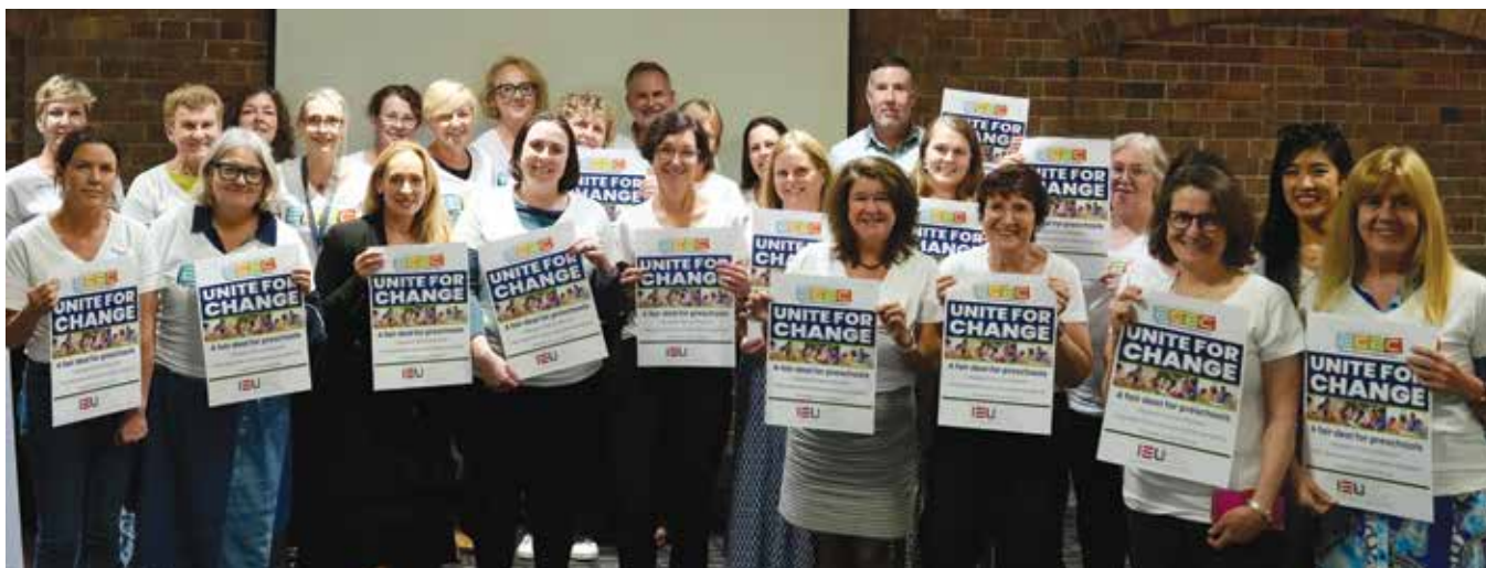
The Unite for Change campaign launch for pay rises for staff in community preschools on 5 April in Sydney.

Western Sydney University Early Learning Services Agreement has been reached for the Western Sydney University Early Learning Services (WSUELS) Enterprise Agreement , including 5% above award rates of pay with a 4% increase in July 2024, 3% in July 2025 and 3% in July 2026 and the introduction of an educational leader allowance.