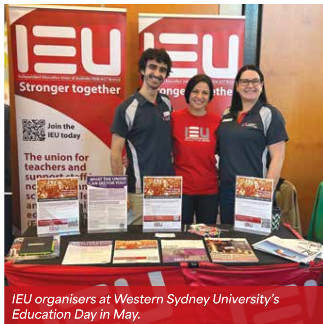
IEU organisers at Western Sydney University's Education Day in May.