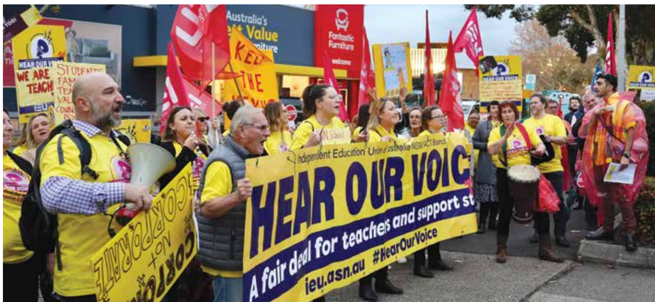
Catholic Schools Office staff at the Hear Our Voice Too stop work, rally and march on 6 June 2024.

The Newcastle office supports members and chapters in the Central Coast, Hunter Valley and parts of the Ku-ring-gai Sub Branches. The office serves over 3600 members in schools from Taree to Sydney's north and west to Merriwa.