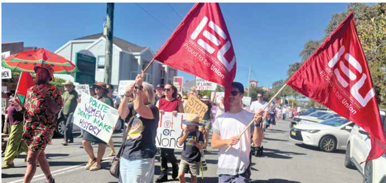
International Women's Day march at Newcastle in March.