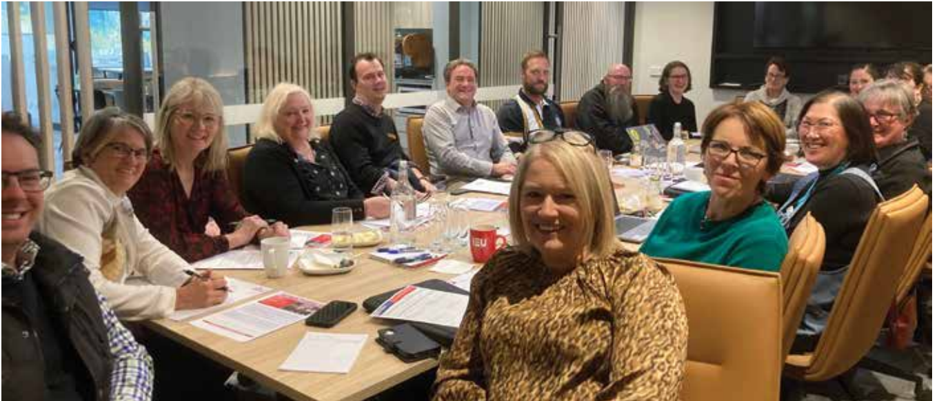
Members at the Monaro Sub Branch meeting in May.