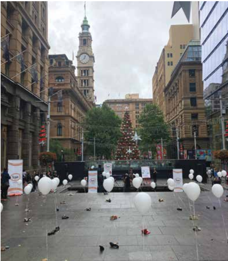
The Empty Shoes Vigil (representing women killed in acts of domestic violence) at Martin Place, Sydney, November 2023.