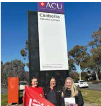
ACU Expo, Canberra.